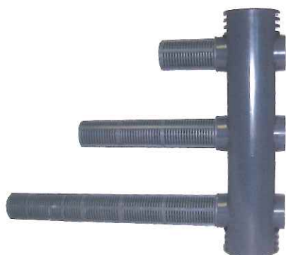
Removable ABS injection laterals

Required silica sand media 0.45 - 0.55 mm grade 20 and 1-2 mm grade 20 support gravel NSF listed sold separately