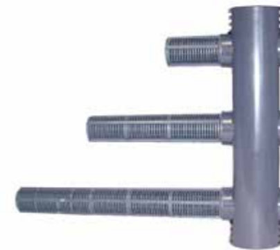
Removable ABS injection laterals

High Rate Sand Filters are constructed in Jacksonville, Fl. Filters have NSF standard 50 approval and are listed for pools and spa. Working pressure 50 PSI and test pressure 75 PSI. Includes pressure gauge, manual air relief valve, water drain manual valve, large sand discharge port, top man-way 16", PVC internal piping water distribution with removable ABS injection laterals slotted at 0.3 mm and 1 1/2 " threaded. Tank is made with filament winding FRP. Multiport valves, standard and customized manifold system available sold separately. Semi and fully automated systems available sold separately. Required silica sand media 0.45 - 0.55 mm grade 20 and 1-2 mm grade 20 support gravel NSF listed sold separately